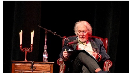
Clancy Brown ( The Shawshank Redemption , SpongeBob ) as our Narrator...